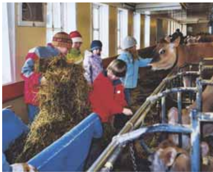
Billings Farm and Museum in Woodstock, Vermont, lets young and old experience what life on a working 19th-century dairy farm would have been like.

About 16 miles north, you'll find another Woodstock, where the Billings Farm & Museum is located. Here you can experience what it was like to operate a dairy farm in the 19th century. I thought it