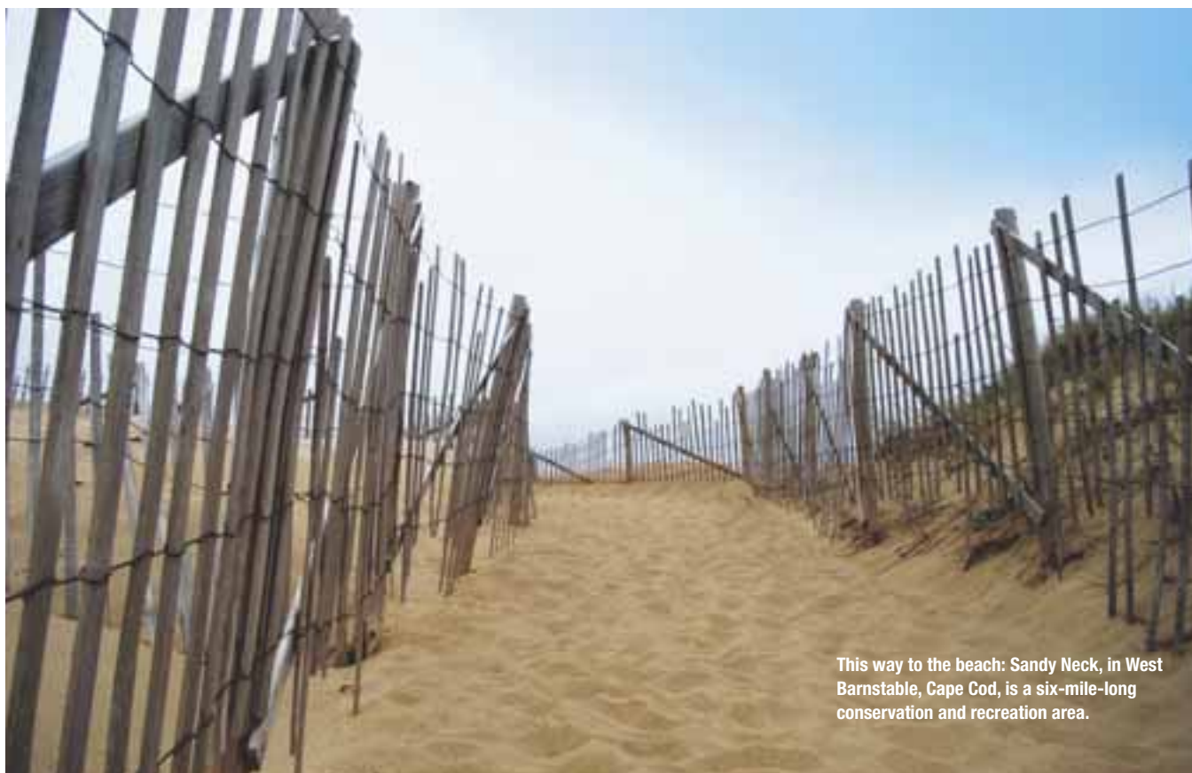
This way to the beach: Sandy Neck, in West Barnstable, Cape Cod, is a six-mile-long conservation and recreation area.