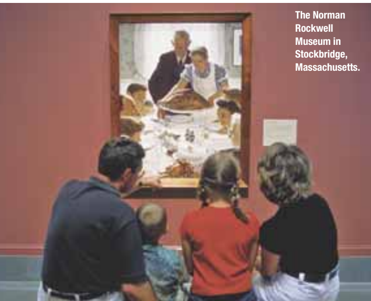
The Norman Rockwell Museum in Stockbridge, Massachusetts.