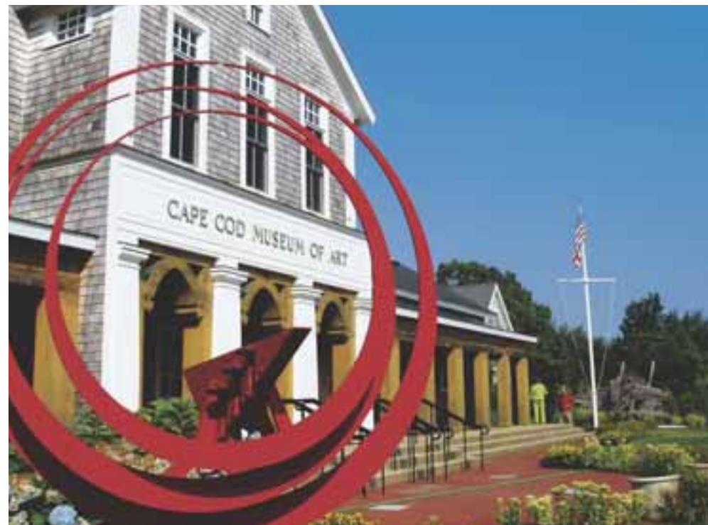
The Cape Cod Museum of Art houses a collection of works by artists associated with Cape Cod and the neighboring islands. FACING PAGE: Nobska Light, in Woods Hole, on Cape Cod. The present tower was built in 1876.

There's plenty to do and see in and around Falmouth, too, including gazing at grand homes, popping into specialty shops, and sampling great